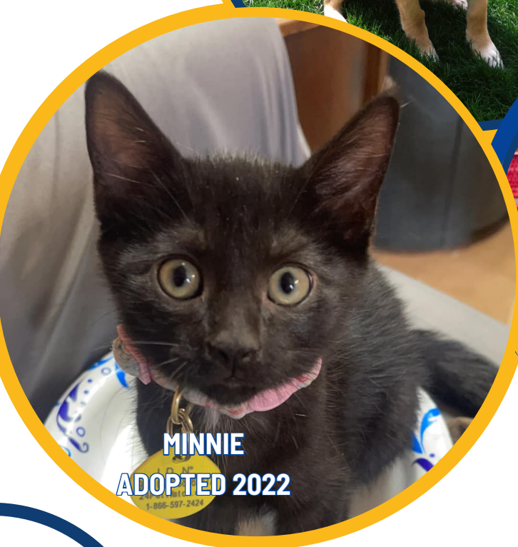
MINNIE ADOPTED 2022