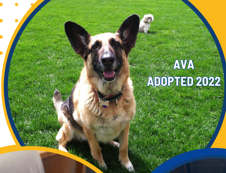
AVA ADOPTED 2022