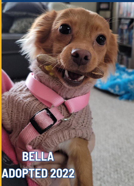
BELLA ADOPTED 2022