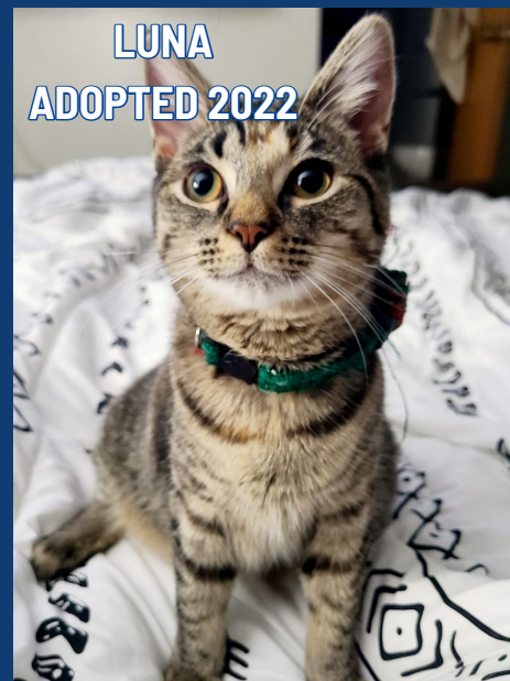
LUNA ADOPTED 2022