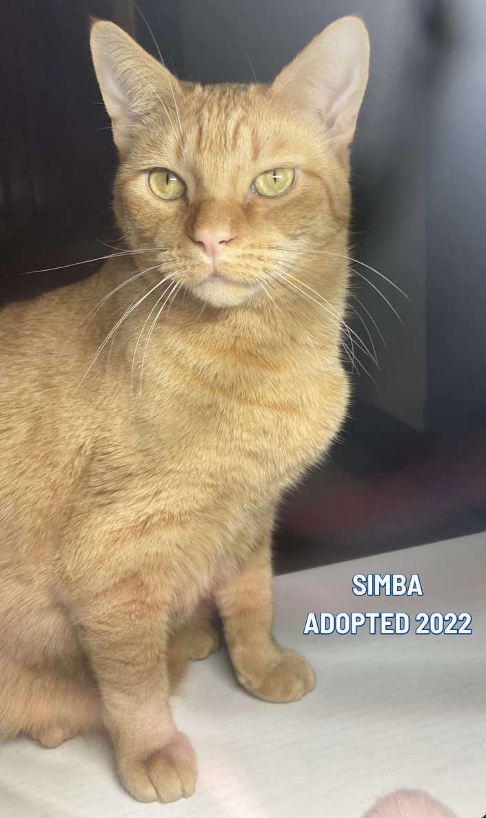
SIMBA ADOPTED 2022